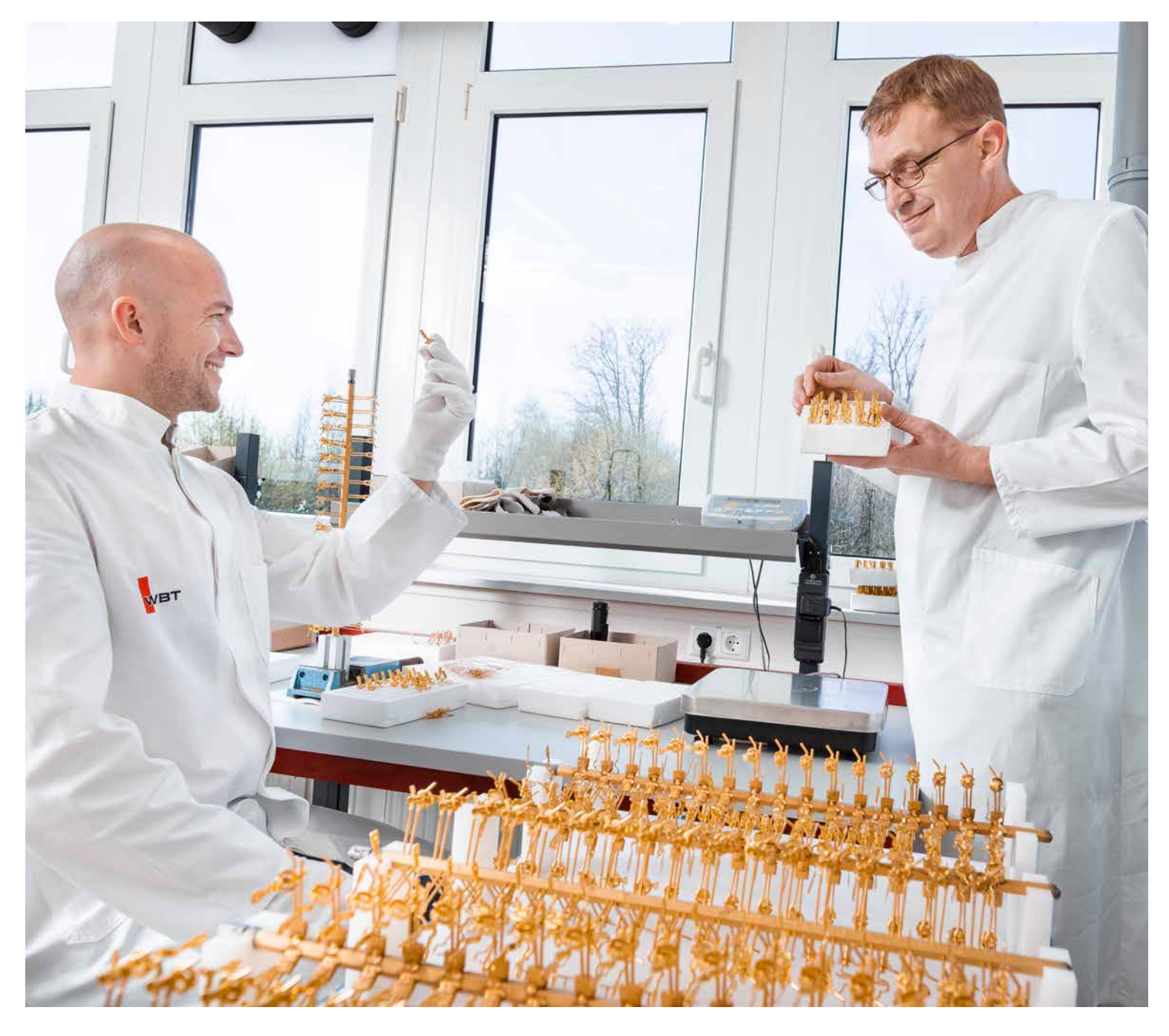
WBT PVD PlasmaProtect<sup>™</sup> Connectors